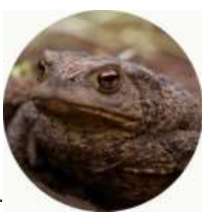
toads like frogs but with darker bumpy skin