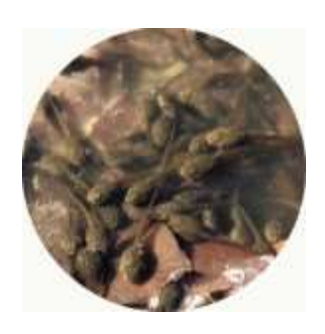
tadpoles dark with round heads and long tails