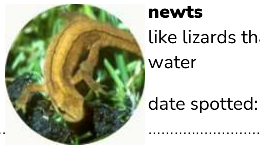
newts like lizards that live in water