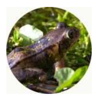
frogs green with legs that jump high!